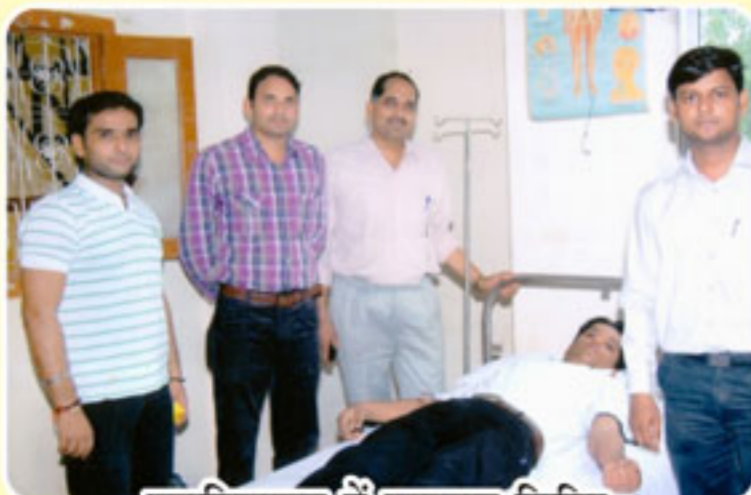
महाविद्यालय में रक्तदान शिविर का आयोजन।