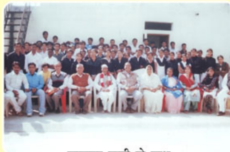
फाउन्डर ट्रस्टी के साथ महाविद्यालय के छात्र - छात्रायें।